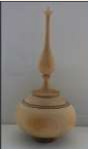
Finial Box 1