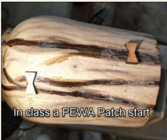
In class a PEWA Patch start