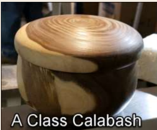
A Class Calabash