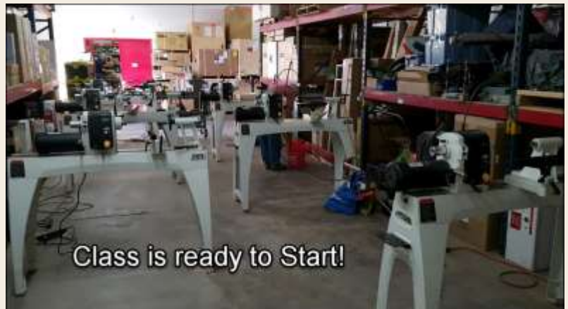
Class is ready to Start!